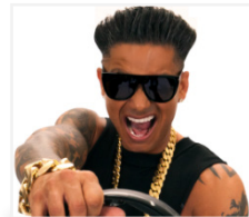
FEATURED GUEST DJ Pauly D Star of Jersey Shore and Double Shot at Love